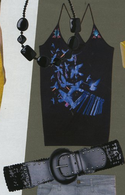
Balenciaga goes futuristic with metallic fabrics